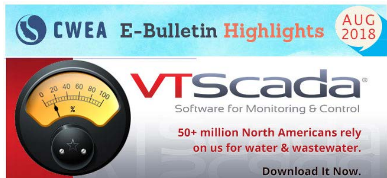
Example of the E-Bulletin banner advertising. Sent monthly to all 10,000 CWEA members.